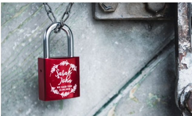
Personalized anodized aluminium safety lock