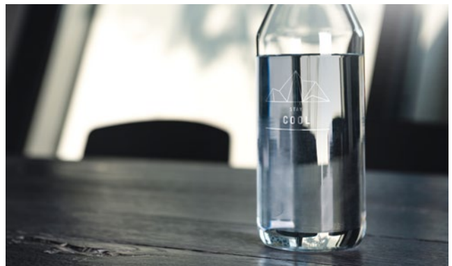
Finest engravings on glass