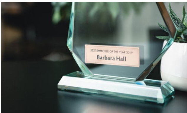
Customized trophies made quickly and easily