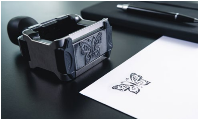
Engraving of laser rubber for stamps