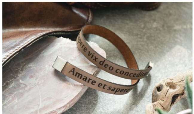
Creative engravings on leather