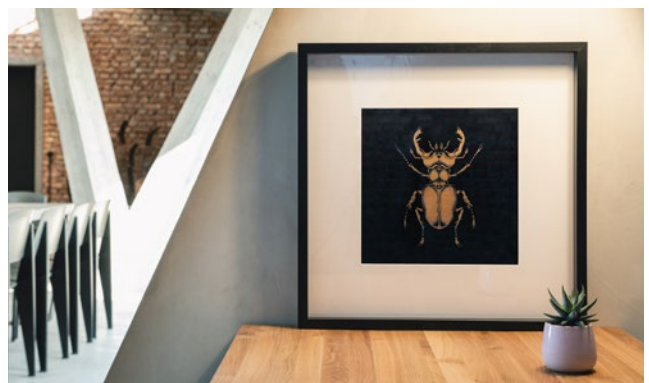
Signs made of TroLase