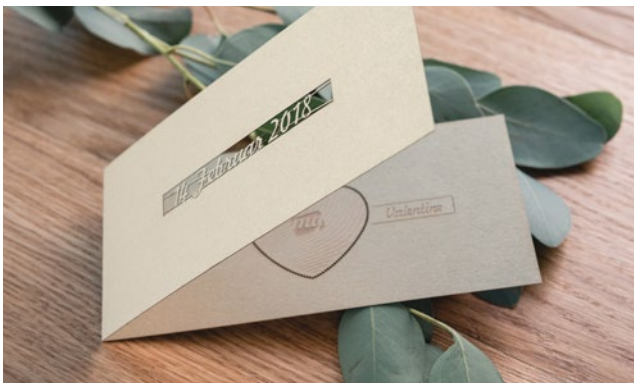
Clean paper finishing and finest contours